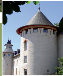
Le Château Corbin