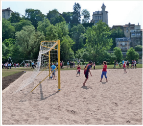
La zone de loisirs