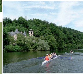
Le Château de la Flie vu depuis la Moselle